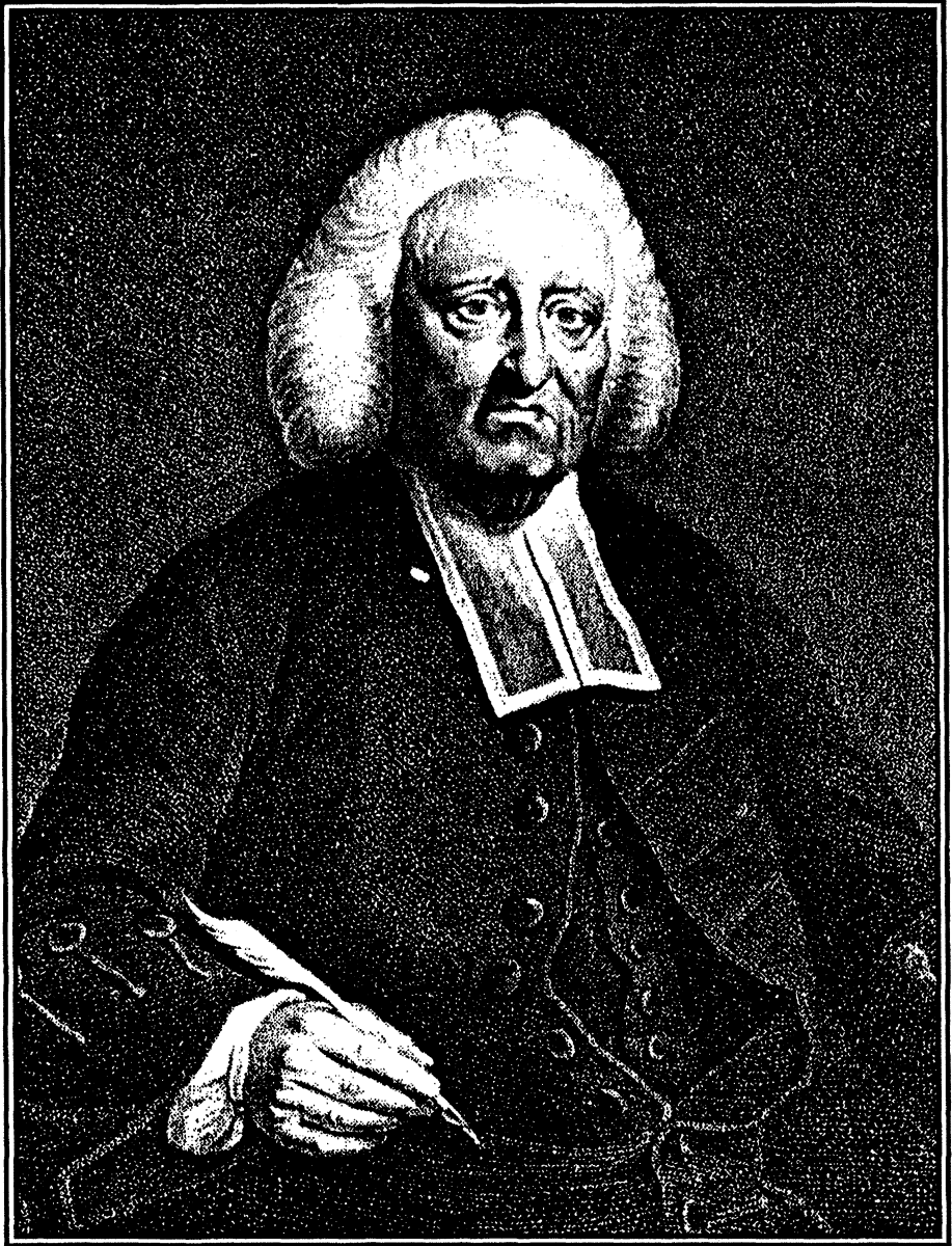
JOHN GILL, D.D. 1697-1771